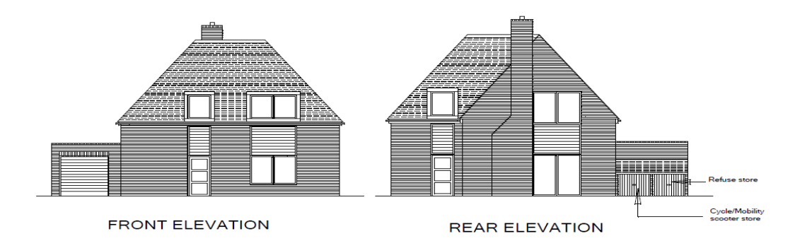
Figure 2 – Front and rear elevation of proposed dwelling

8.4 Policy DM10.1 requires residential development proposals to be of high quality and whilst seeking to achieve a minimum height of 3 storeys, should respect the development pattern, scale, height, density and appearance. The proposed development would provide a two-storey single family dwelling. The prevalent height and scale of the properties in the vicinity is two-storeys and given the change in land levels, the scale of neighbouring properties to the north (with all having been constructed into the sloping ground - varying from one to two storeys) and with land levels also increasing from north to south, officers are satisfied with the principle of the two storey bulk of the proposed dwelling. Moreover, the proposed dwelling would follow the ridge heights of the Holland Court development to the south and would have a higher ridge height (compared to 13 Woodplace Lane) given the increasing land level. It is considered that the proposed development would respect the scale, height and massing in the local area in accordance with Policy DM10.1 and would follow a similar development form as the neighbouring development to the south.