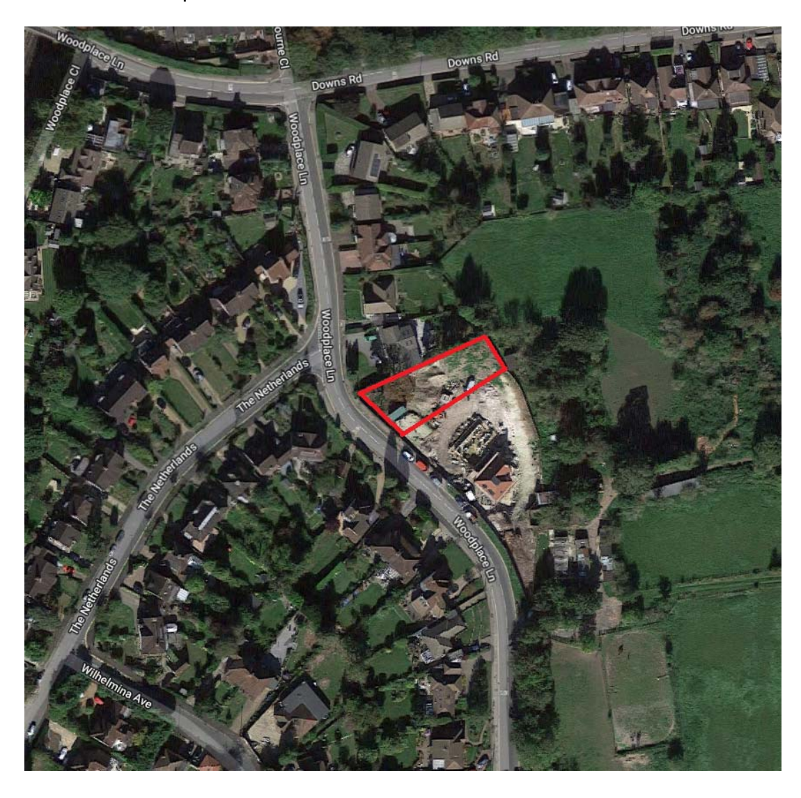
Figure 1 – Aerial view of site